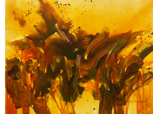
◀ The Sediment of Time, 《岁月的智慧》 2022

This artwork captures the essence of transcending limits for broader views. This artwork inspires viewers to surpass the familiar, exploring greater beauty and possibilities from a higher perspective. It's an invitation to contemplation on the transformative power of seeking higher ground, both literally and metaphorically, to gain a more profound appreciation of the world's vastness and splendour.