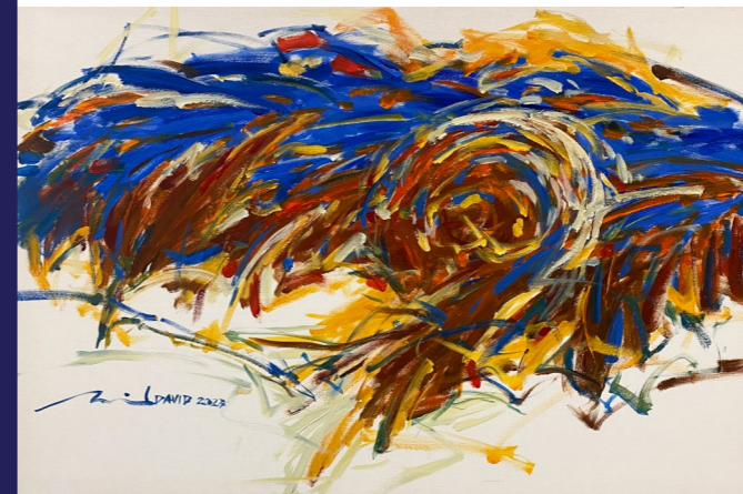
◀ Change, 《变》 2023

This artwork is inspired by Van Gogh's Wheat Field with Crows. While Van Gogh's piece conveys 'sadness, extreme loneliness', it also seeks to show something 'healthy and fortifying about the countryside'. In my piece, I retain the golden wheat fields but discard the foreboding shadow of crows and the gloomy clouds, leaving only sunshine and the vast landscape. This piece is more than just a painting for me; it is an emotional refuge. It reminds me that, no matter the storms I face, the sunlight will always dispel the clouds, and hope will always take root and grow in my heart.