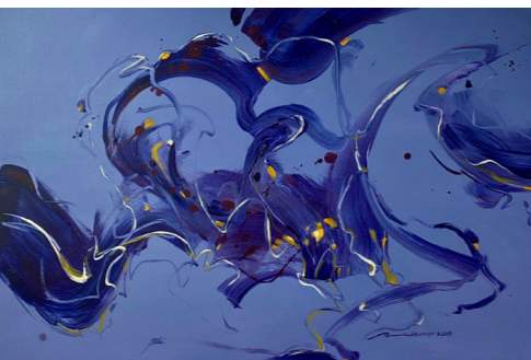
◀ Movement-I, 《动-I》 2024 — Acrylic on canvas 60cm x 90cm RM3,600

This piece revisits the essence of action painting, where every brushstroke and motion flows from my intuition in the moment. This approach, sparked by a chat about human versus digital (AI) artistry, makes me believe that as a human artist, I bring a unique sense of movement to my pieces. You can feel the warmth of my hands in the flowing lines and energetic strokes, each one a reflection of the human touch.