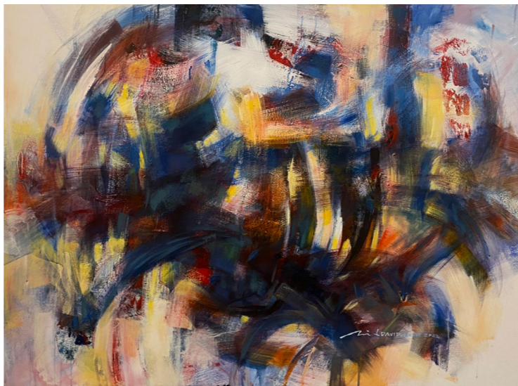
◀ Unconditional Love, 《大爱》 2023

This creation is a dialogue between father and son: the five-year-old expressed freely with colours in motion, while the father responded to complete the piece. It reflects a connection between generations, a deep exchange of feelings, and a passing down of wisdom to sustain for years to come.