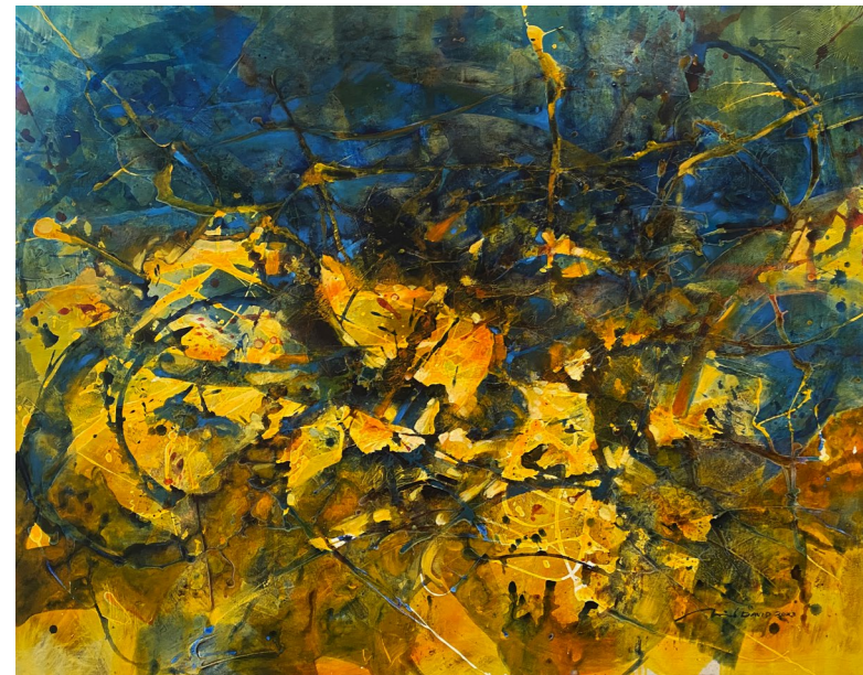
◀ Beyond Horizons: Ascend to New Vistas, 《忘掉地平线、飞的更高》 2023

— Acrylic on canvas 122cm x 152cm RM11,900