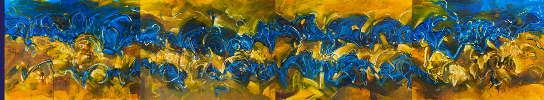
▶ Wheatfield with Hopes, 《希望的麦田》 2023

Expressing ideas through abstract art and interpreting them through abstract strokes are both forms of dialogue between hearts and minds. Our perspectives are shaped by our unique interests, experiences, and circumstances. This often creates barriers to effective dialogue but also offers a unique opportunity for multivocal expression. We hope this art show serves as a forum where different minds connect and spark unique interactions.