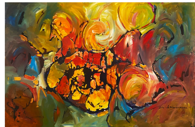
▶ Completeness, 《完整》 2012

Regardless of the challenges and changes encountered, one should maintain inner peace and determination, facing everything with grace. Experience the confidence and tranquility from deep within, and transform it into strength to overcome challenges.